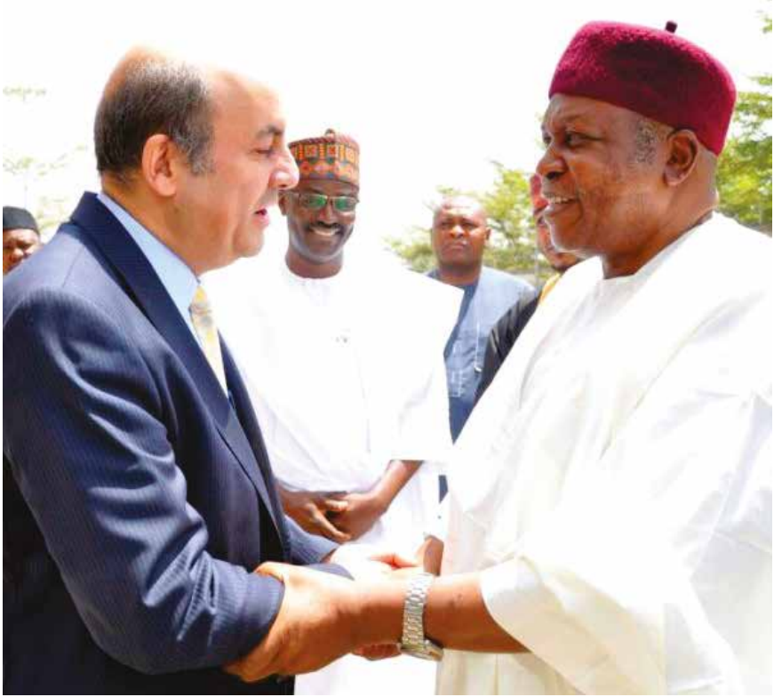
Governor Ishaku welcoming the Turkey Ambassador, exploring areas of cooperation.

With nature's gift and Ishaku's insight, various dormant sectors have been revived. Today, the state is on the path to achieving the main objective of the Taraba Rescue Project – that is to be an economic, social, cultural, and political powerhouse, ultimately becoming one of two leading economies within the north east by 2025. Within the lifespan of the Ishaku administration –it is in its sixth out of eight years – Taraba state has been transformed from a little known state tucked away in Nigeria's volatile northeast into a growing, prosperous and peaceful state with global aspirations. Taraba state is openand ready for business and Governor Ishaku is proud to showcase the