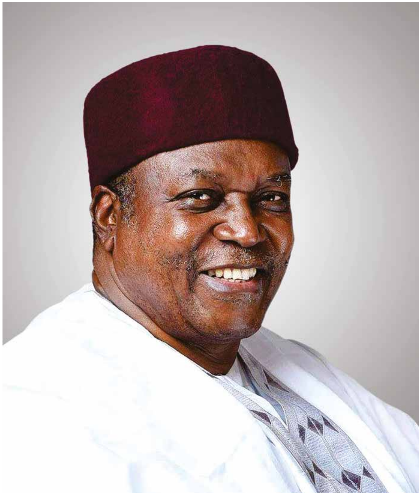
HIS EXCELLENCY ARC. DARIUS DICKSON ISHAKU EXECUTIVE GOVERNOR TARABA STATE